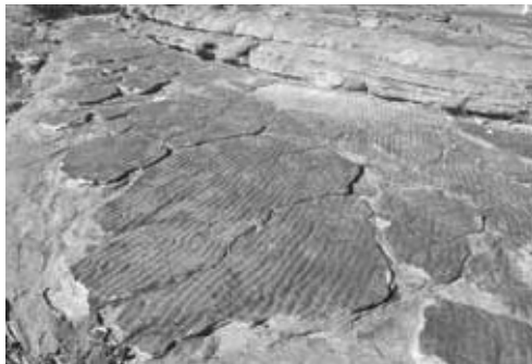
These ripple marks show how sediment was moved by flowing water.

Some sedimentary rock features show the motions of wind and water. For example, some sedimentary rocks show ripple marks or mud cracks. Ripple marks are parallel lines that show how wind or water has moved sediment. Mud cracks form when fine-grained sediment dries out and cracks.