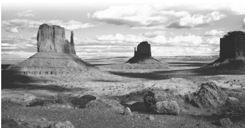
These “monuments” in Monument Valley, Arizona, formed as sedimentary rock eroded over millions of years.

Sediment is deposited in layers. Therefore, most sedimentary rocks contain layers called strata (singular, stratum ).